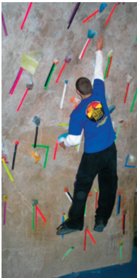
The Cliffs at Valhalla is a hot spot for fun and challenging birthday parties and for children and adults honing their climbing skills.

With the cold weather approaching, carb-laden options hold special appeal. Trotta's of Thornwood (also on Commerce Street) is a pasta-lovers paradise. Just in time for the holidays, this amazing little Italian specialty shop is featuring homemade pumpkin ravioli. Fresh mozzarella is always on hand, as is a freezer case packed with "take home and heat up" Italian favorites.